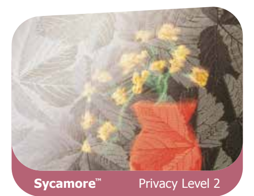
Privacy Level 2