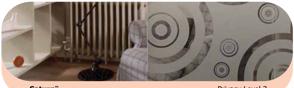
Privacy Level 3