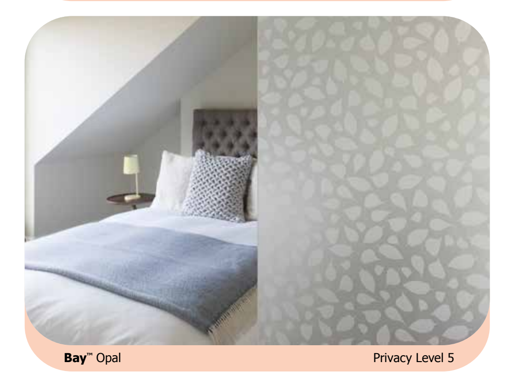
Privacy Level 5