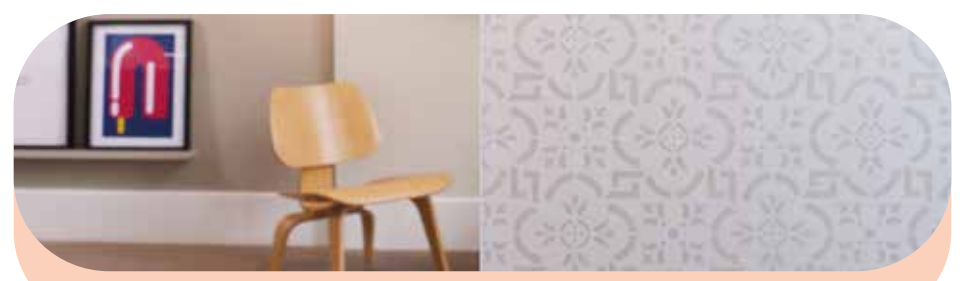
Canterbury <sup>™</sup> Opal